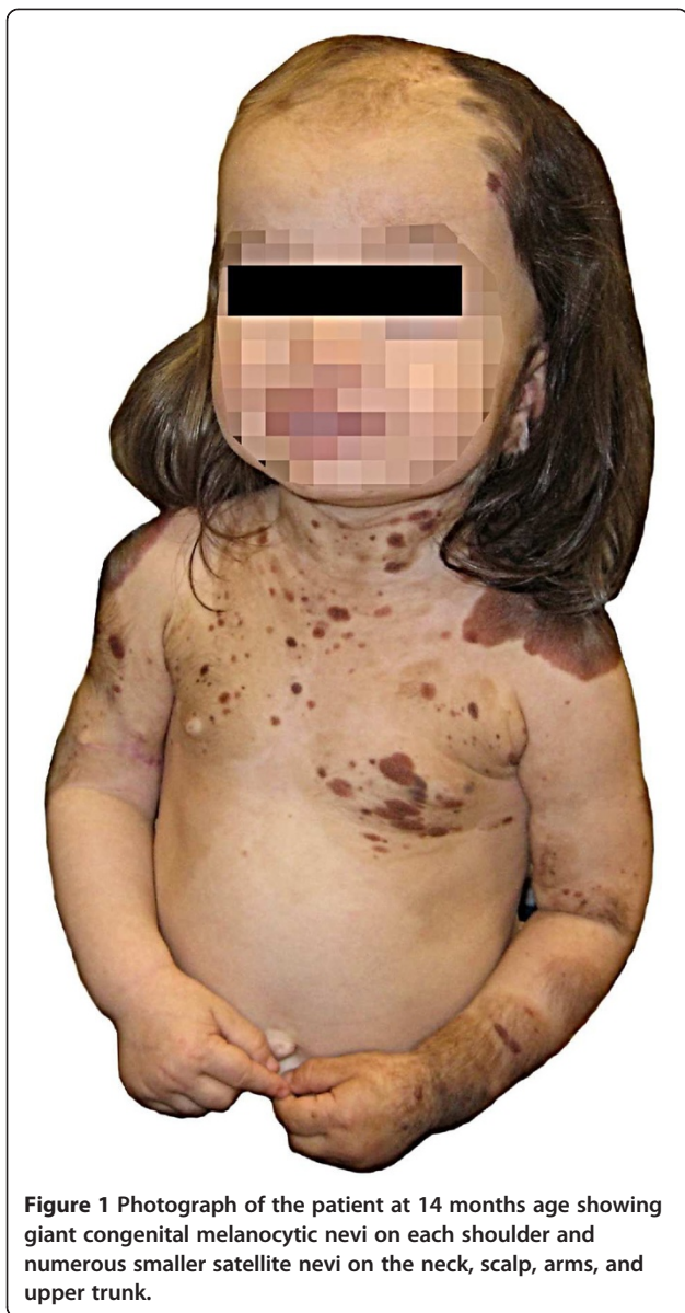
Figure 1 Photograph of the patient at 14 months age showing giant congenital melanocytic nevi on each shoulder and numerous smaller satellite nevi on the neck, scalp, arms, and upper trunk.

with signal characteristics the same as cerebrospinal fluid (CSF) were present around the atria of the lateral ventricles in the right cerebellopontine cistern along with small cysts around the bodies of the lateral ventricles. The left cerebral hemisphere was larger than the right, and parietal white matter volume was abnormally small. The combination of giant congenital nevi along with cerebral melanin deposition led to a clinical diagnosis of NCMS [10]. A CT scan of the head performed at 4 months age during an episode of status epilepticus showed no additional abnormalities. An abdominal sonogram performed the following day showed no abnormalities. Repeat MR imaging showed the presumed melanocytic nodule had increased to 3 mm; it was hyperintense on T1, hypointense on T2, and hyperintense