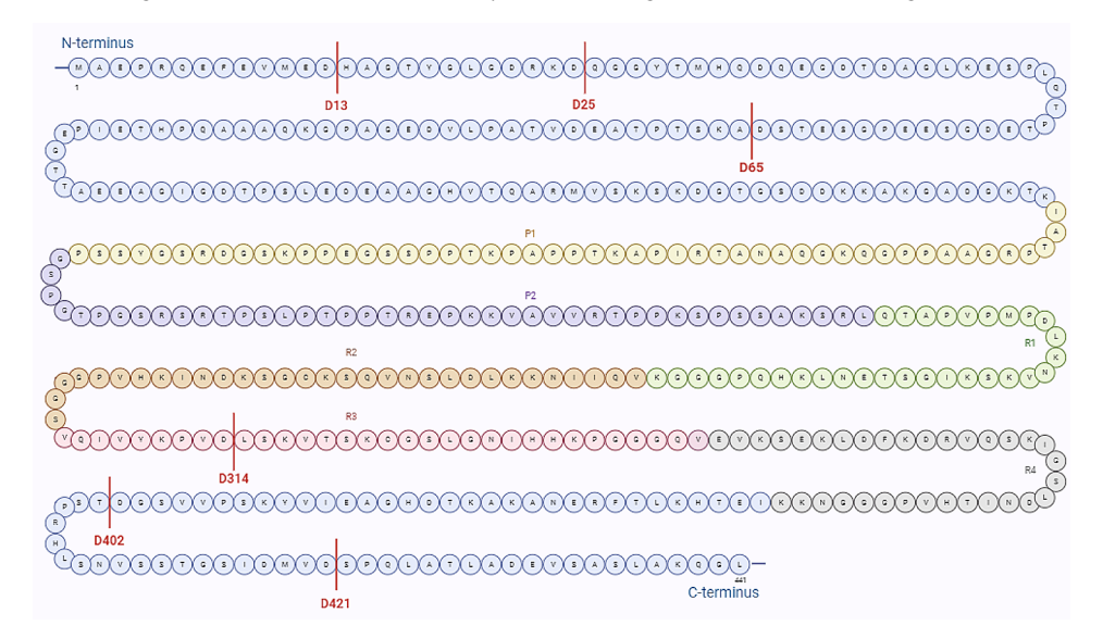
Fig. 2 Putative sites caspase-cleaved tau. Caspases 1, 3, 6, 7, and 8 cleave tau at D421. Caspase-2 cleaves tau also at D65 and D314, caspase-3 cleaves tau also at D25, caspase-6 cleaves tau also at D402 and D13. Tau consists of four domains: the projection domain (M1–Y197), a proline-rich region (P1 and P2), the microtubule-binding repeats (R1, R2, R3, R4), and a C-terminus domain (K369–L441). Amino acids 1-441